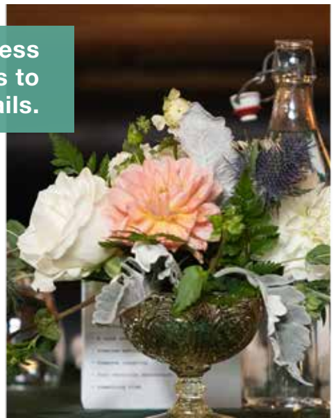
Table Arrangements .....$45 - $205