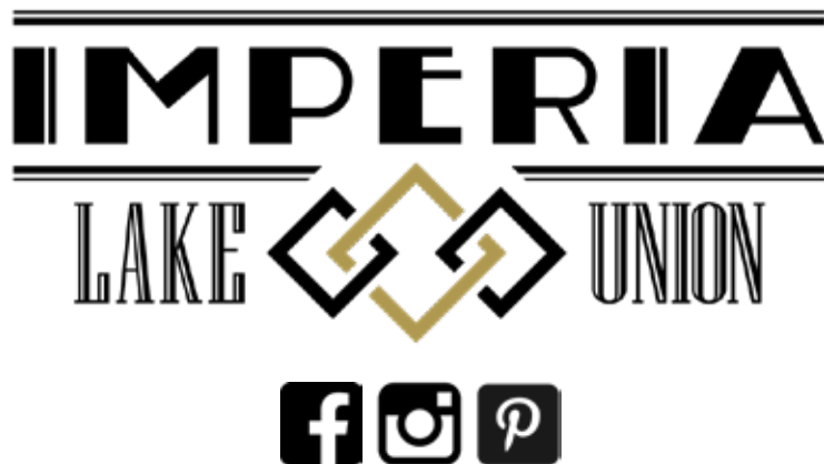
Photo credits available on our website's image gallery page. Thank you to our photographers and our lovely couples.